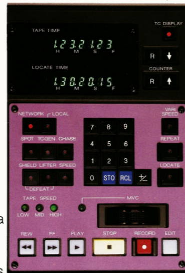
APR-5003 control panel

Tape tensions, speed servo control, a thirty memory programable AutoLocator, and audio alignment are among its responsibilities. On the APR-5003 center track time code unit, a built-in time code generator is provided as well as an internal chase/lock capability which allows the machine to synchronize to incoming timecode—EBU and SMPTE (Drop/Non-Drop). It is also possible to cue up any desired point by the 10 keys on the control panel. A varispeed range of \pm 50\% is included, making the transport a versatile tool for both music recording and broadcast applications.